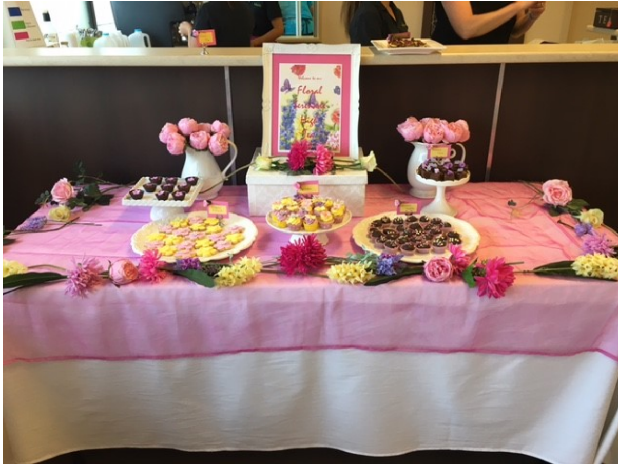
Picture: Mother's Day High Tea