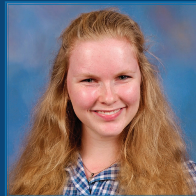
Summer, 2016 State Top Design Nomination for Food Studies